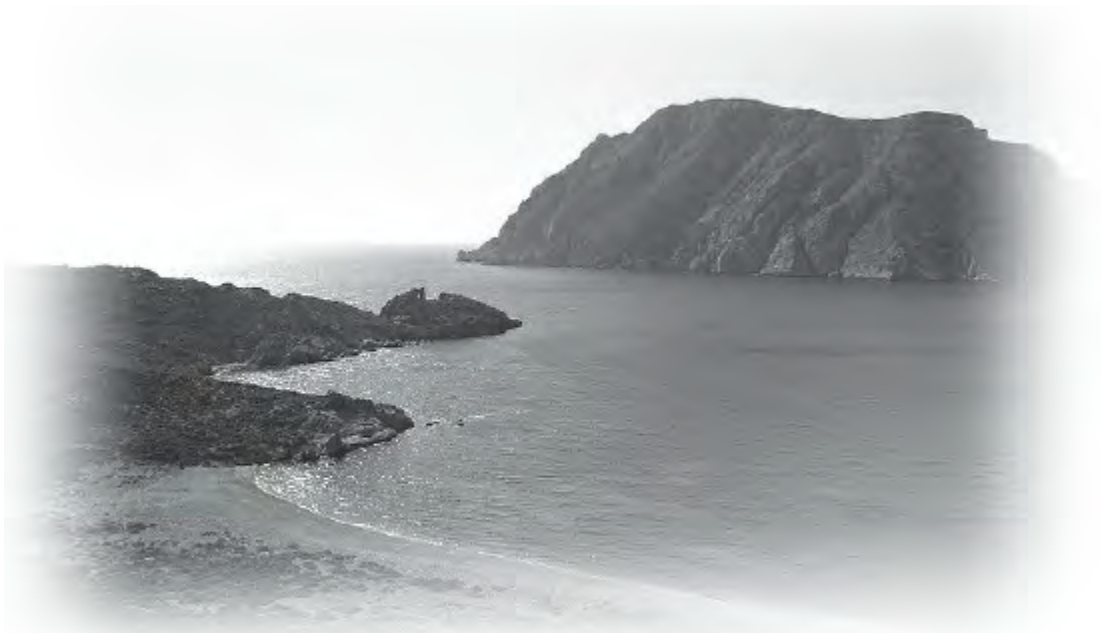
The Island of Patmos